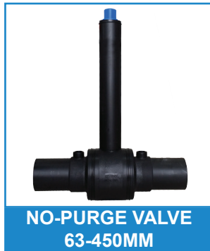
NO-PURGE VALVE 63-450MM