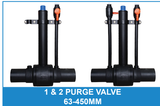
1 & 2 PURGE VALVE 63-450MM