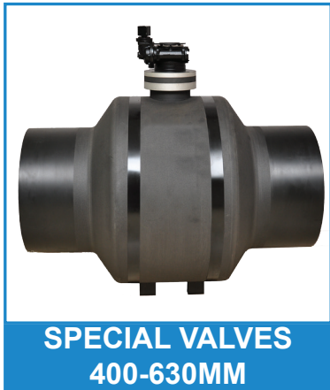
SPECIAL VALVES 400-630MM